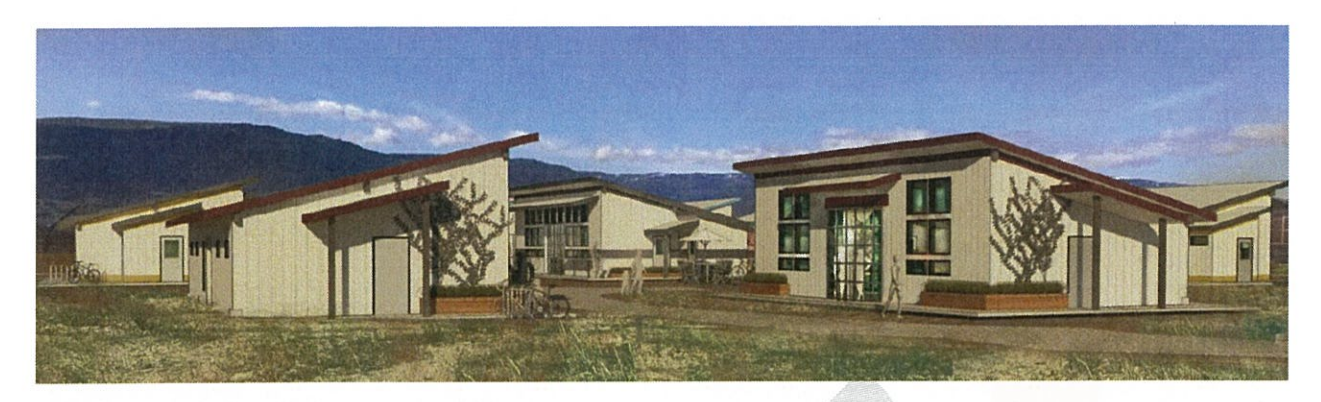
Exhibit 4: Potential Redevelopment Schematic