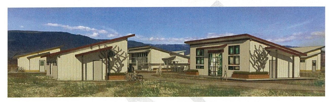
Exhibit 1: Pangborn Airport Business Park "Pods"

Increase jobs and economic activity in Chelan and Douglas Counties by modifying and completing the Pangborn Airport Business Park Giga Watt Pods to assist in the growth and formation of businesses with an emphasis on supporting Latino businesses.